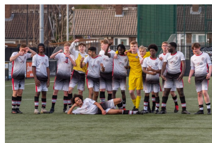
Football Team 2 celebrating winning the West Midlands Football League