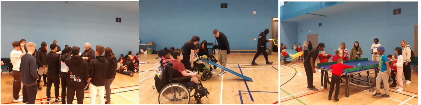
Images from a Panathlon Event held at Birmingham University which included Sports Leaders and Organisers across Sports Courses at BMET as part of their Course and Work Experience requirements.