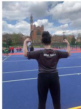
Members of the League Winning Netball Academy officiating and supporting the Primary Schools Netball Tournament with the Community Games at Birmingham University