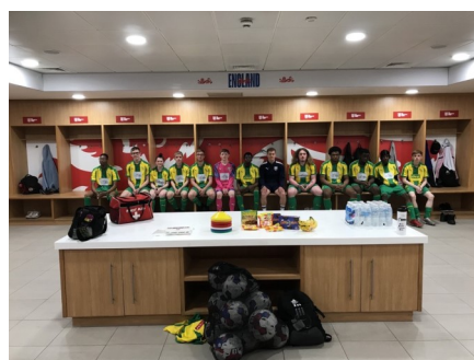
Pan-Disability National Champions in the England National Team Training Ground Dressing Room @ St. Georges Park