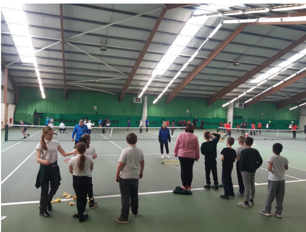
Another Day ... Another Event—Sports Students leading Multi-Sports Events at Billesley Tennis Centre. New Places = New Experiences