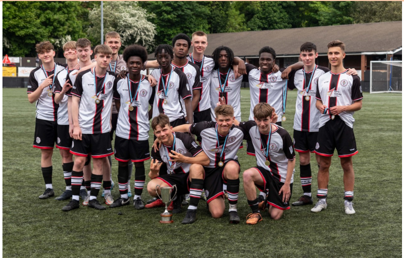
The victorious Men's Football team with the ESSFA Trophy after beating Plantsbrook School 5-1.