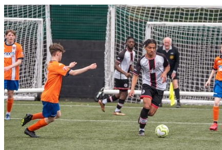
Men's Football First Team in Action in the recent 10-0 win versus Stratford