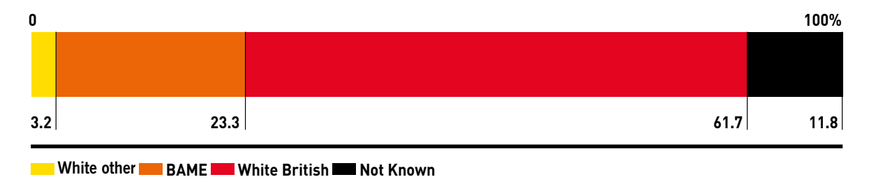
Chart 2 – The percentage of staff by ethnicity

In a similar picture to last year the highest proportion of BAME staff is among teaching staff (26.5%) and the least ethnically diverse group of staff are managers with 14.8%, as shown in Table 5. This however reflects a +4.6% increase in BAME representation at management level from 2018. Dedicated activities to explore the barriers to attraction and progression of BAME staff were undertaken in support of the Diversity and Inclusion Strategic Action Plan and work is ongoing for 2019/20.